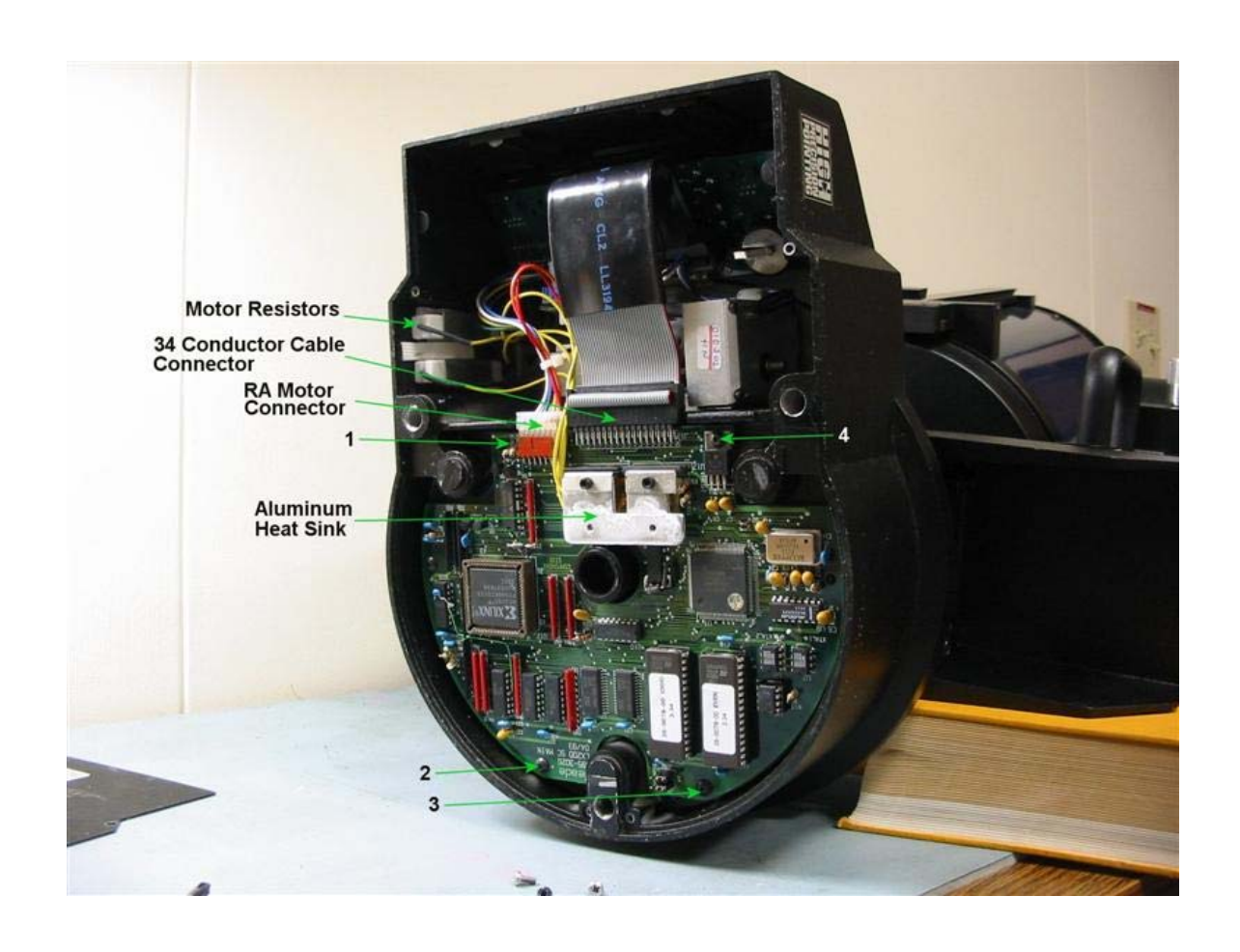
Fig 1 Main PCB Mounted in base